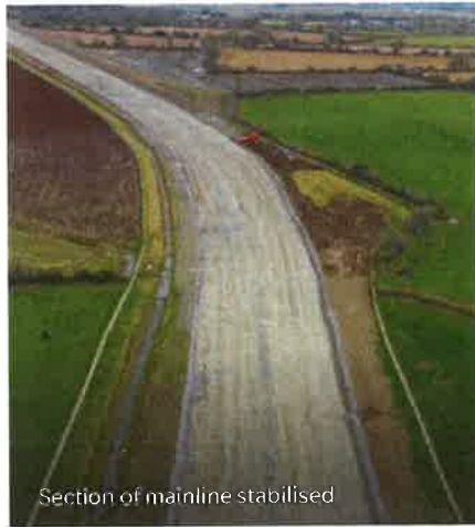
Section of mainline stabilised

Roadworks activities have progressed slowly over the last quarter due to inclement weather. Bulk earthworks is almost complete with only limited areas to be completed..