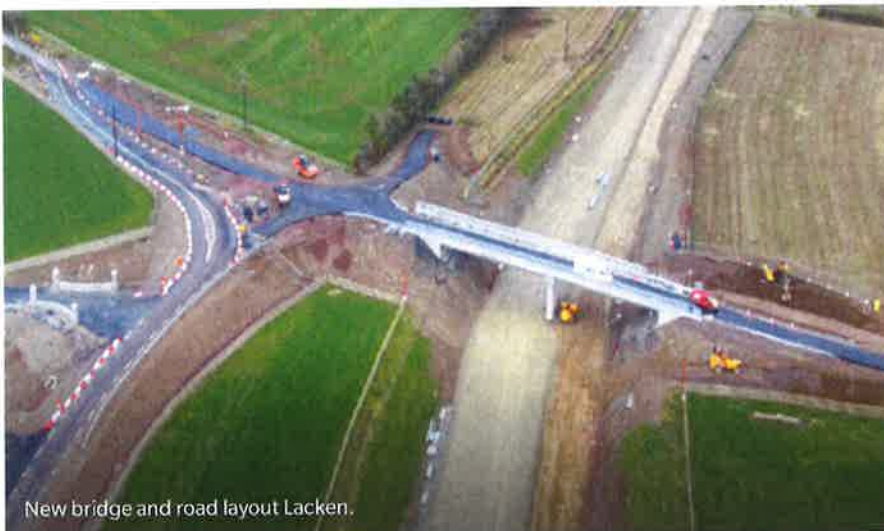
New bridge and road layout Lacken.

Pavement foundation construction is well advanced with over 80% of the foundation now complete (stabilised). Other pavement base courses such as CBGM and lower base course are being carried out at present.