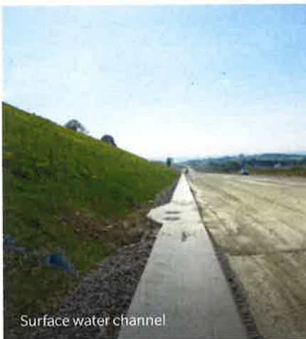
Surface water channel