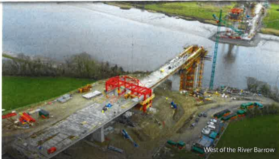
West of the River Barrow

The Barrow Bridge is divided into three sections at the moment, west of the river, main span and east of the river.