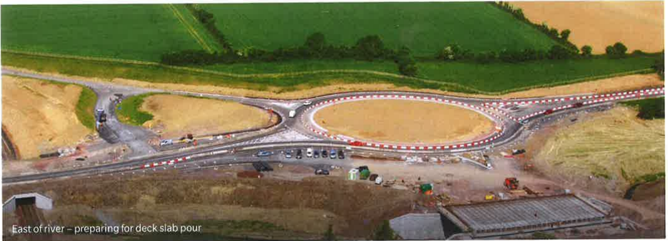
East of river – preparing for deck slab pour