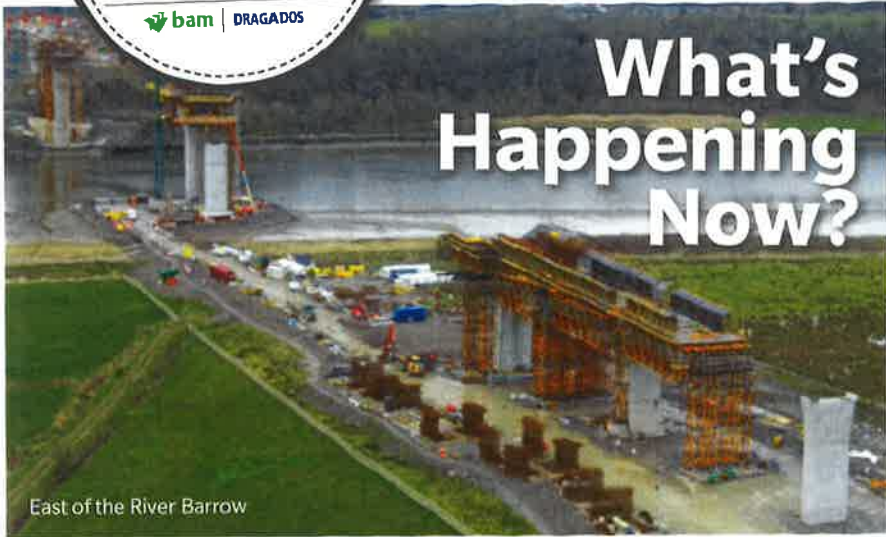
East of the River Barrow