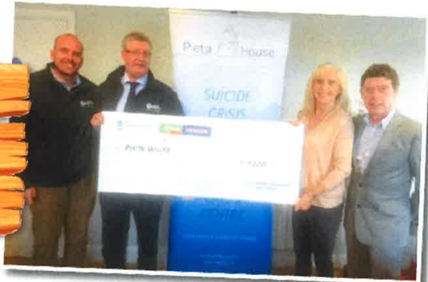
Over €8,000 euro was raised by the NRJV employees for Pieta House. The presentation of the money raised was held in the Waterford branch of Pieta House on February 20th 2018.